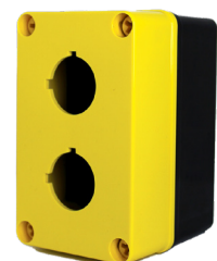
SAFETY YELLOW (ONE OR TWO HOLES)