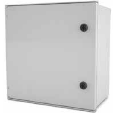
Endurance | Opaque Cover (E)