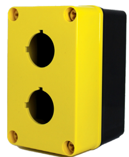
SAFETY YELLOW (ONE OR TWO HOLES)