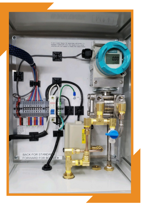
Interior of Automatic Bubbler System made with AttaBox Industrial Enclosure

He continues, "AttaBox® Heartland™ enclosures feature a very rugged hinge, and multi-directional mounting feet allow for more customizable installations. Moreover, these polycarbonate enclosures are far more costeffective than stainless steel alternatives. We definitely recommend AttaBox."